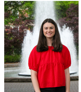
Sage Barlow Poultry Science