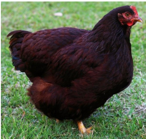
Rhode Island Red