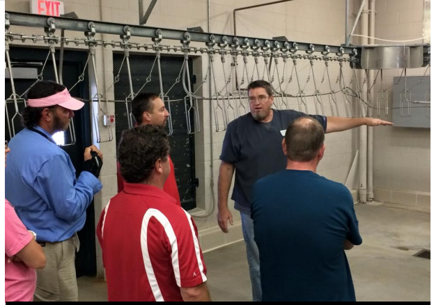
Participants toured the Poultry Farm facilities to learn more about UGA Poultry Science classes.

Participants enjoyed learning about student life in the department. Touring the Poultry Research Center, and learning about scholarship and internship opportunities available to UGA Poultry Science students helped the instructors understand